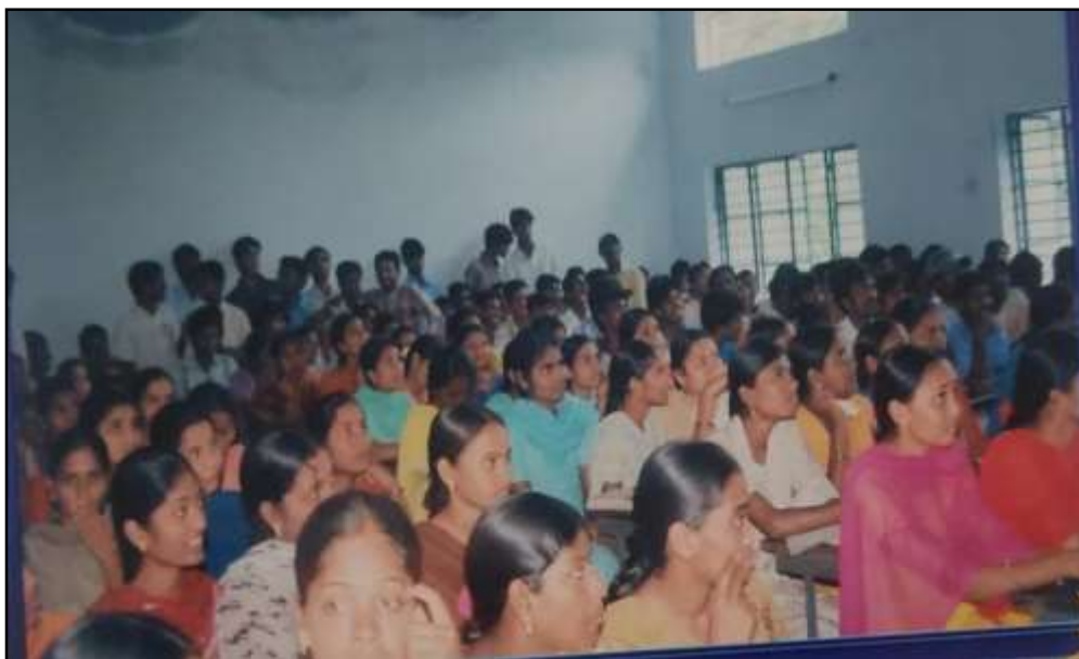
Student's participation in the programme on 28-11-2016